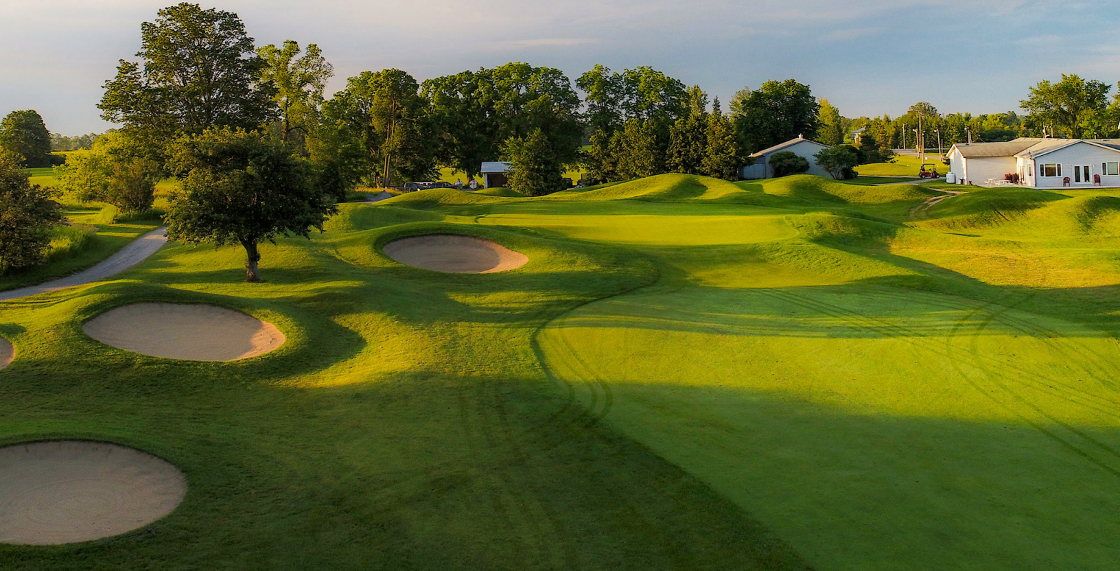
Oliver's Nest Golf Course